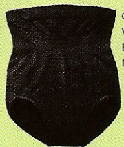
CONTROL IT WAISTNIPPER BRIEF, $25, MAIDENFORM.COM

Look for a shaper with high-cut legs and a full bottom to cinch the waist and smooth and shape the rear.