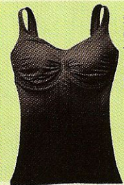
SASSYBAX UNDERWIRE TORSO TRIM, $75, HIPUNDIES.COM

Opt for a long tank-style shaper. Go for one with an underwire bra to offer extra support if you're full busted.