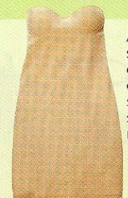
ALL OVER SLIMMING COMFORT CONTROLWEAR SMOOTHING SLIP, $51, FLEXEES.COM

Try an all-in-one bra, slip, and shaper for a tighter tummy and smoother silhouette. Wearing an all-in-one garment is more comfortable than wearing multiple undergarments.