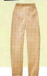
SPANX CAPRI SMOOTHER, $68, HIPUNDIES.COM

Try a pant-style shaper in a lightweight fabric. You'll get a slimming effect through the thighs and hips and eliminate the see-through problem.