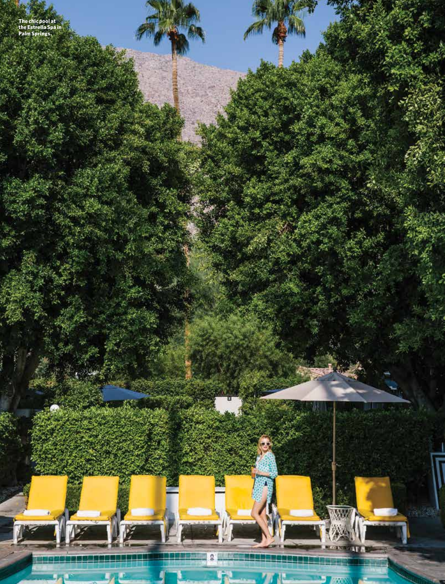
The chic pool at the Estrella Spa in Palm Springs.