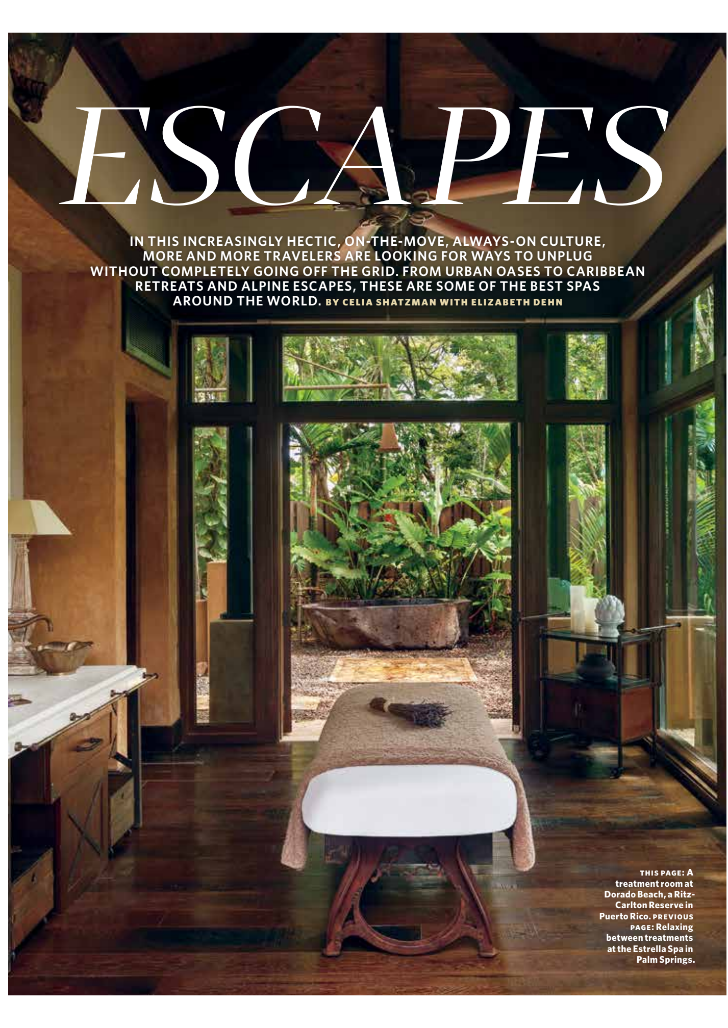
THIS PAGE: A treatment room at Dorado Beach, a Ritz-Carlton Reserve in Puerto Rico. PREVIOUS PAGE: Relaxing between treatments at the Estrella Spa in Palm Springs.

IN THIS INCREASINGLY HECTIC, ON-THE-MOVE, ALWAYS-ON CULTURE, MORE AND MORE TRAVELERS ARE LOOKING FOR WAYS TO UNPLUG WITHOUT COMPLETELY GOING OFF THE GRID. FROM URBAN OASES TO CARIBBEAN RETREATS AND ALPINE ESCAPES, THESE ARE SOME OF THE BEST SPAS AROUND THE WORLD. BY CELIA SHATZMAN WITH ELIZABETH DEHN